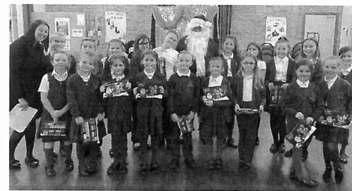
The choir have had a fabulous afternoon performing for the Age-Uk panto. As always they performed brilliantly and had lots of fun.